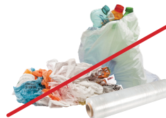
NO Loose Plastic Bags, Bagged Recyclables or Film Empty recyclables directly into your bin. NO bolsas y envolturas de plástico sueltas, o materiales reciclables embolsados Vací directamente los materiales reciclables en nuestro carrito