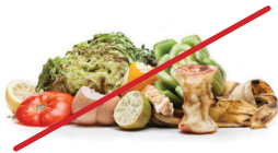
NO Food or Liquids NO comida o líquidos