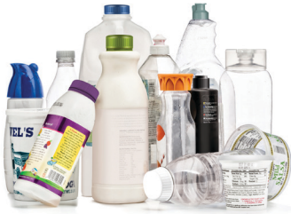
Plastic Bottles & Containers Botellas y envases de plástico