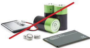
NO Batteries – check local drop-off programs for proper disposal NO baterías - Verifique los programas locales de entrega para su correcta eliminación