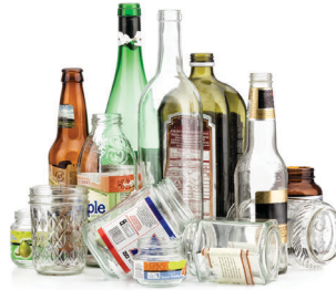
Glass Bottles & Containers Botellas y envases de vidrio