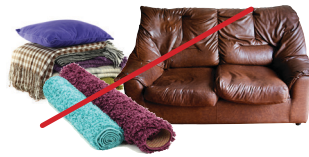
NO Clothing, Furniture & Carpet NO ropa, muebles y alfombras