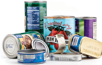
Food & Beverage Cans Latas de alimentos y bebidas