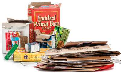
Flattened Cardboard & Paperboard Cartón y cartulina aplastados