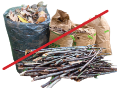
NO Green Waste NO desechos verdes