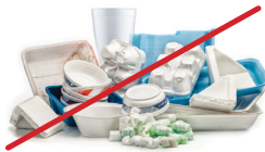
NO Foam Cups & Containers NO vasos y recipientes de poliestireno