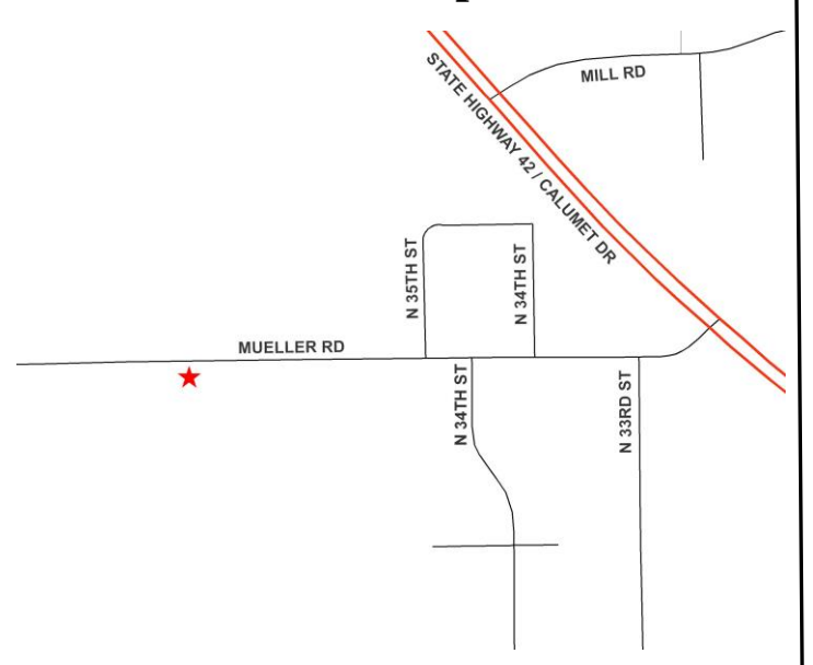
Maywood Environmental Park